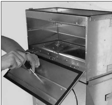
4. Attach clamping rail