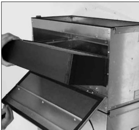
7. Install filter