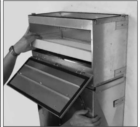
3. Install filter