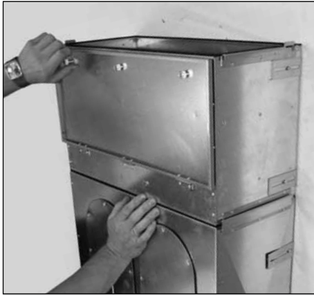
1. Undo screws