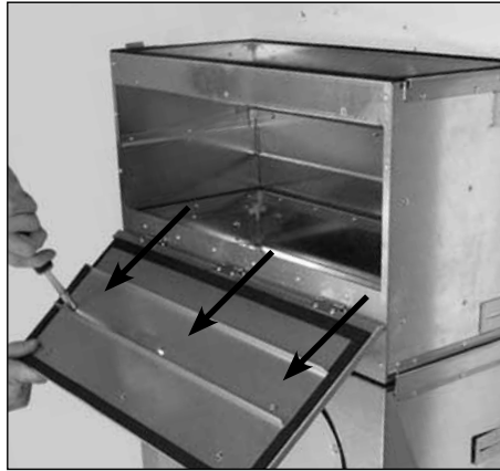
2. Open cover and unscrew clamping rail on cover