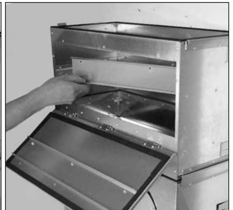
6. Rotate and secure