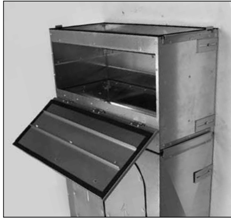
2. Open cover