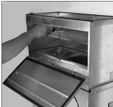
5. Unscrew clamping rail from housing bottom