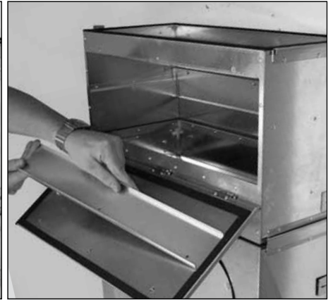
3. Rotate clamping rail