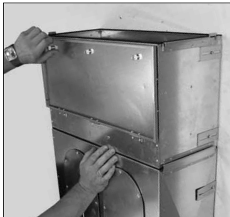
8. Close cover and tighten screws